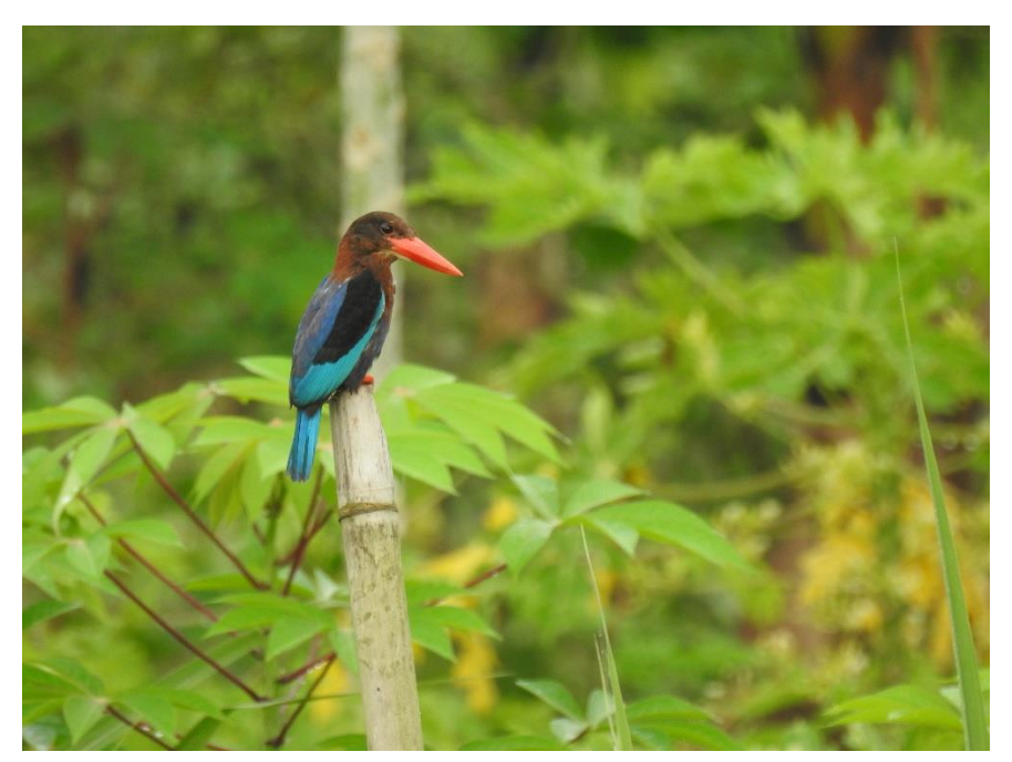
Figure 4 Javan Kingfisher in Cikukulu Creek