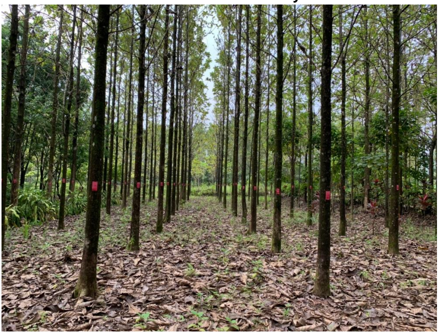
Figure 2 Teak wood plantation in Quarry D