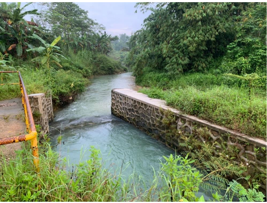
Figure 3 Cikukulu Creek in Quarry D