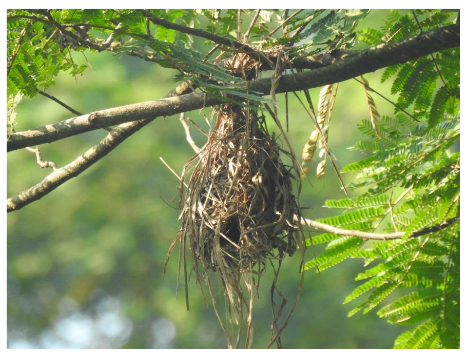
Figure 5 Bird Nest found in Quarry E